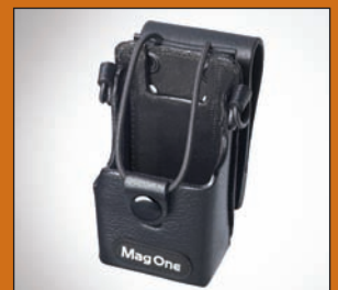
Mag One Hard Leather Case PMLN4742