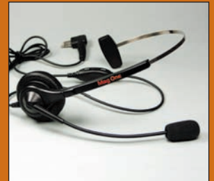
Mag One Ultra Lightweight Headset with In-line PTT/VOX Switch PMLN4445