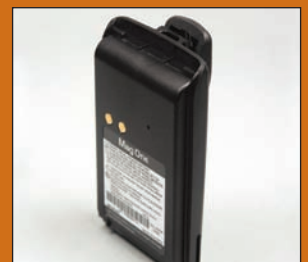
Mag One 1200mAh NiMH Battery PMLN4071_R