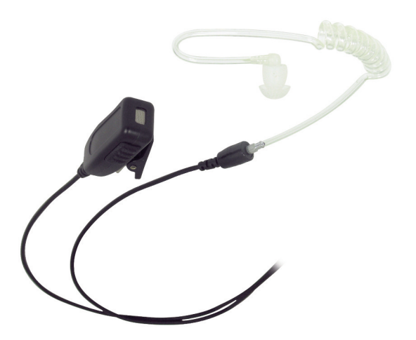
• Miniature PTT

· Yconstic Inpe Yssemply with Kubber Ear Tip