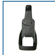
Holster Belt Clip 221115