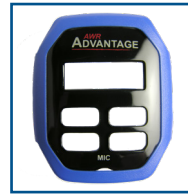
Blue Faceplate 221057