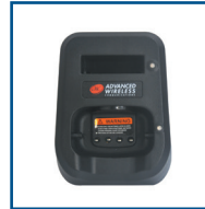
Single Unit Charger 221052