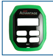
Green Faceplate 221056