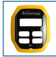
Yellow Faceplate 221060