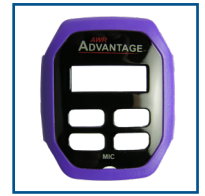
Purple Faceplate 221058