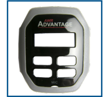
Silver Faceplate 221059