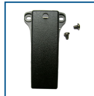
Belt Clip 221049