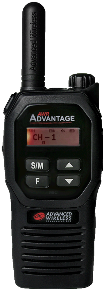
AWR Advantage (with holster & battery) 106094