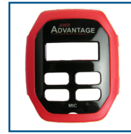
Red Faceplate 221055