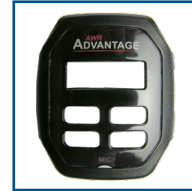
Black Faceplate 221054