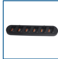
Six Unit Charger 221053