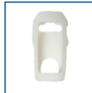
Rubber Sleeve 221050