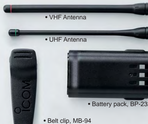
• VHF Antenna