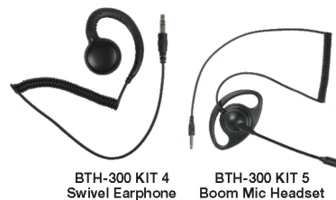
BTH-300 KIT 4 Swivel Earphone

EMERGENCY BUTTON This can be used to place the connected 2-way radio into emergency mode.