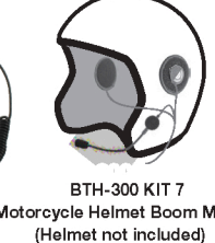
BTH-300 KIT 7 Motorcycle Helmet Boom Mic (Helmet not included)

Radio accessories made right. Service made easy.