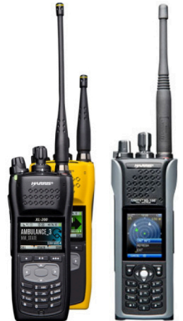
UNITY XL-200 UNITY XG-100