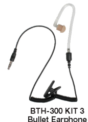
BTH-300 KIT 3 Bullet Earphone