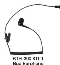
BTH-300 KIT 1 Bud Earphone

Use your own headset or choose from 7 other PRYME headsets. Includes built-in wireless PTT.