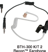
BTH-300 KIT 2 Recon™ Earphone