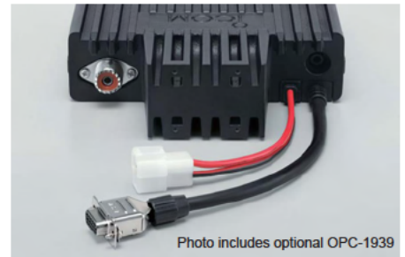
Photo includes optional OPC-1939

With the optional OPC-1939 D-SUB 15-pin ACC cable, the IC-F5021 series can be programmed to control an operating channel from an external device (up to 16 preprogrammed channels). The ACC connector also provides an ignition sensing function, external PTT, PC command, horn honk, audio output and modulated signal input depending on programming.