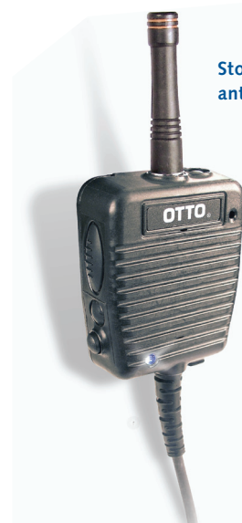
Storm with optional antenna connector